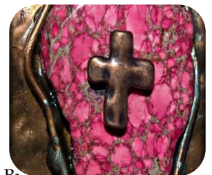
Blackberry Val Medley