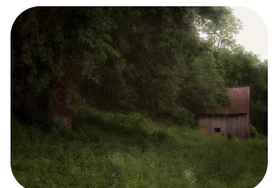
Table Rock Lake Debbie Bridges